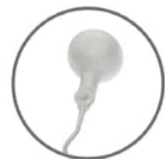
Infla10® X AdaptiveReservoir™ 65ml

Caution: Federal Law (U.S.) restricts this device to sale by or on the order of a physician.