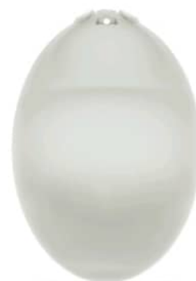
Saline Filled Testicular Prosthesis

Testi10 ™ is designed with high quality silicone. The prosthesis is shaped and designed with a soft texture to offer patients missing one or both testicles a more natural like feeling.