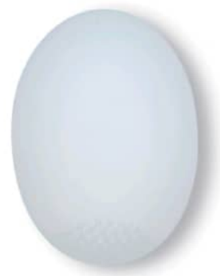
Firm Testicular Prosthesis