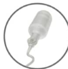
Infla10® X AdaptiveReservoir™ 70ml-110ml